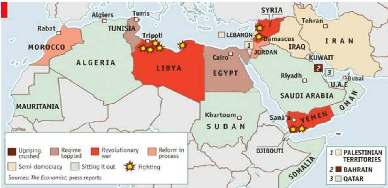
Figure 1.1. The Map of the Arab Spring