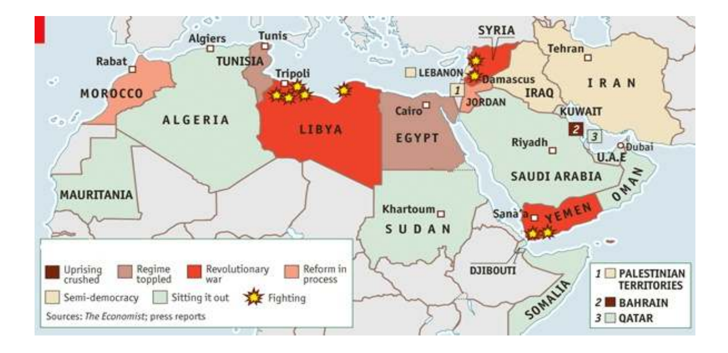
Figure 1.1. The Map of the Arab Spring